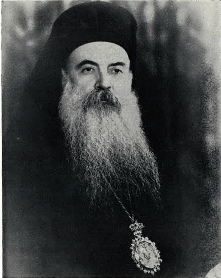
HIS ALL-HOLINESS THE ECUMENICAL PATRIARCH ATHENAGORAS I