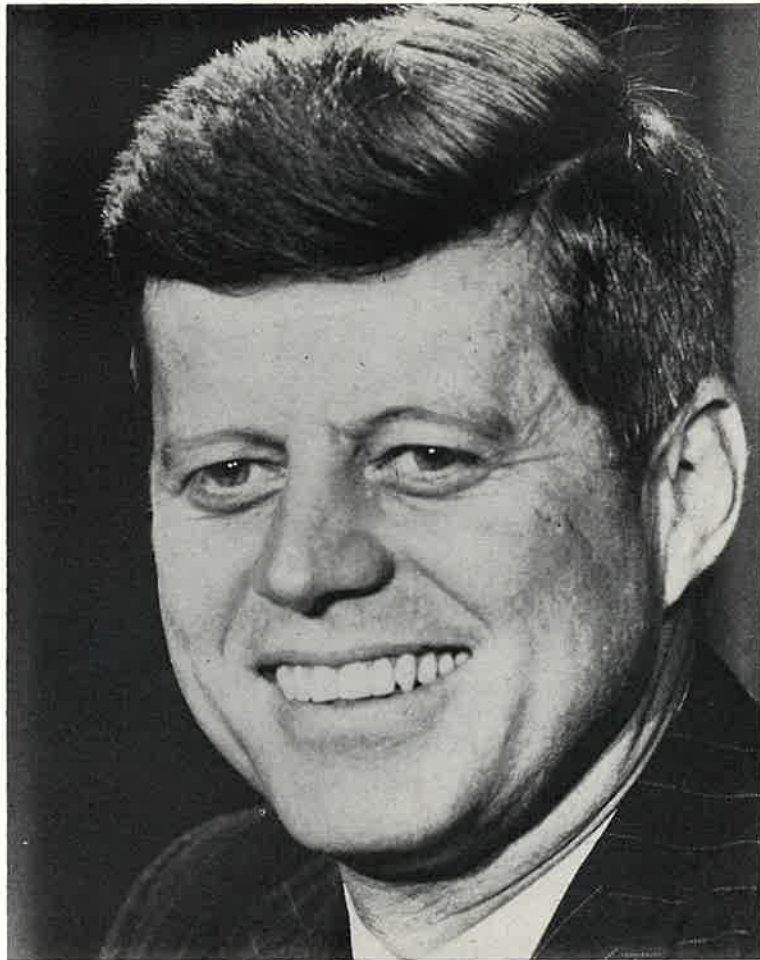
THE PRESIDENT OF THE UNITED STATES JOHN F. KENNEDY