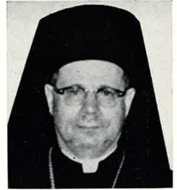
The Right Reverend Bishop Theodosios