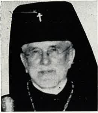
The Most Reverend Archbishop Benjamin