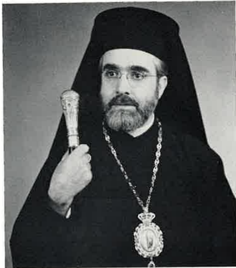
The Most Reverend Archbishop Iakovos Primate of the Greek Orthodox Church of North and South America