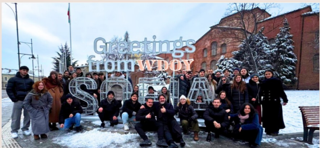
World Day of Orthodox Youth Participants, Sofia, Bulgaria

And yet, over the past two months, SUPRASL witnessed something extraordinary. At two gatherings—one in the snowy quiet of the Monastery of the Annunciation in Supraśl, and one at Kremikovtsi Monastery in Sofia, Bulgaria—we saw that silence is not emptiness. And loneliness is not always despair.